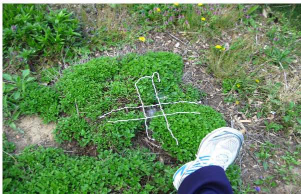
BEFORE MOM VISITS

If the mother rabbit has returned to the nest to nurse her young, the string will be out of place. If the string is undisturbed, and the bunnies appear thin and weak, with wrinkled, baggy skin, the babies may be orphaned. The babies should be taken immediately to a state permitted small mammal rehabilitator in your area. Do not try to feed the bunnies and handle them as little as possible—they stress out easily with human handling.