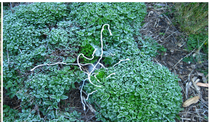
AFTER MOM VISITS