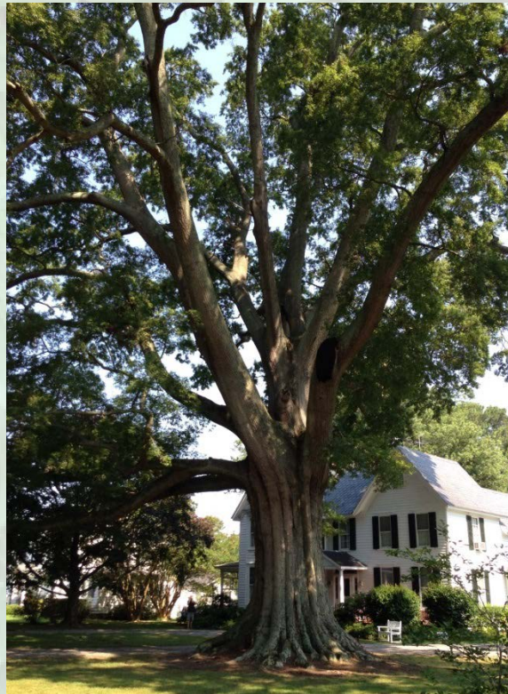
The national champion willow oak in Northampton, VA.

The Virginia Big Tree Program is affiliated with the National Big Tree Program, which is administered by American Forests. Virginia has consistently ranked among the top-5 states for national champion trees.